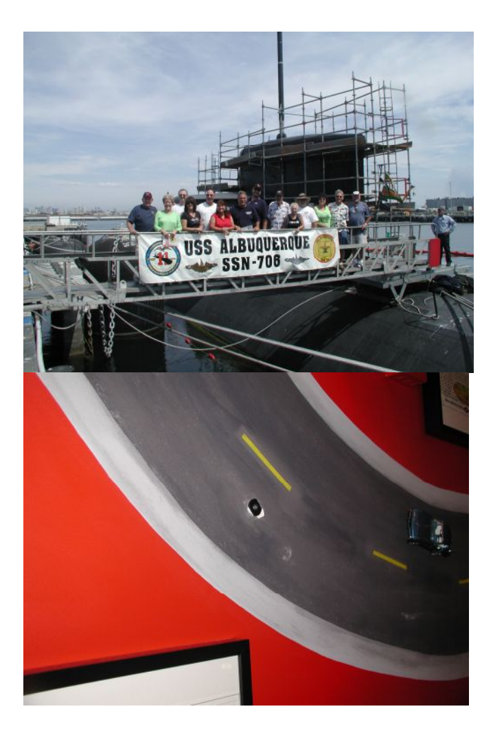
Unfortunately we were not permitted to take been? Pictures below but here is part of the crew.