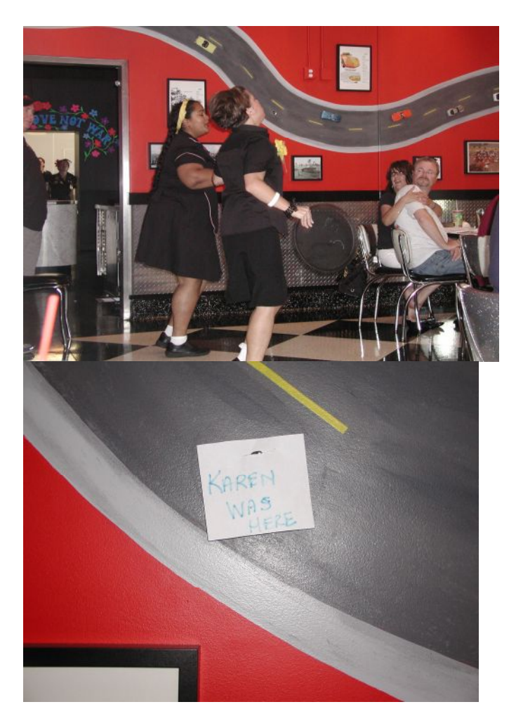
A bit more conspicuous here!