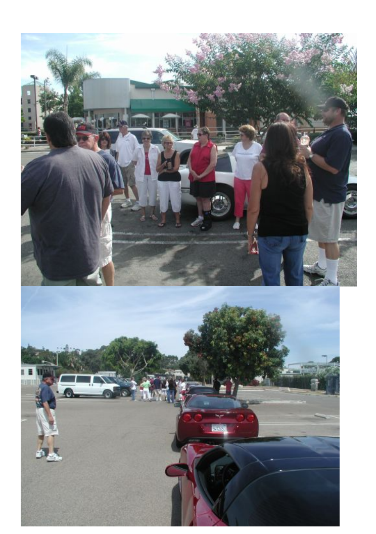
This is as motley a crew as I have ever seen before the in basic training