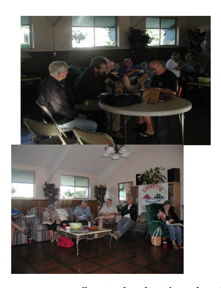
Come to a board meeting and you too can be pictured here!