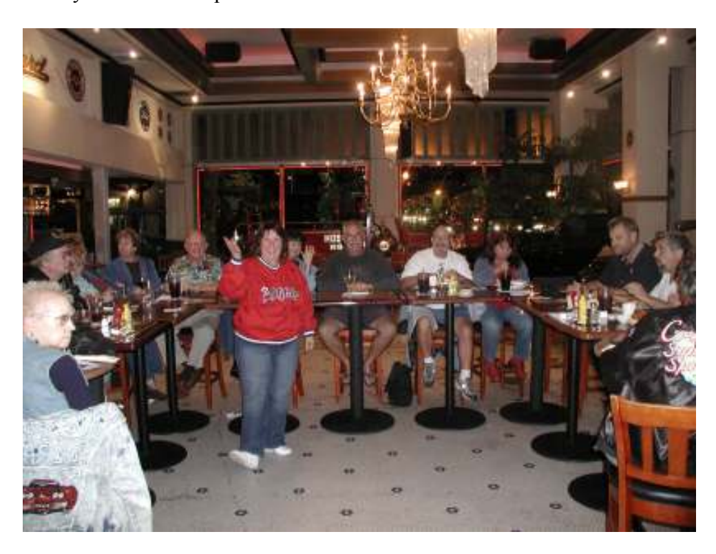
Come to a board meeting and you too can be pictured here!

Don't forget the Board Meeting on the 3<sup>rd</sup> Tuesday of the month at 7:00 PM. The meetings' venue will be changed each month to add variety. Board meetings are open to all members. We encourage you to attend and welcome your comments pro and con.