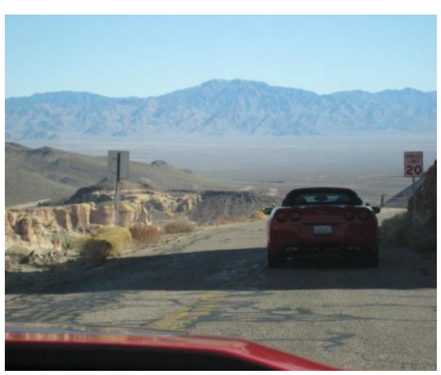
Speed Limit sign lost the second "0" on Route 66 back to Kingman, AZ from Oatman.