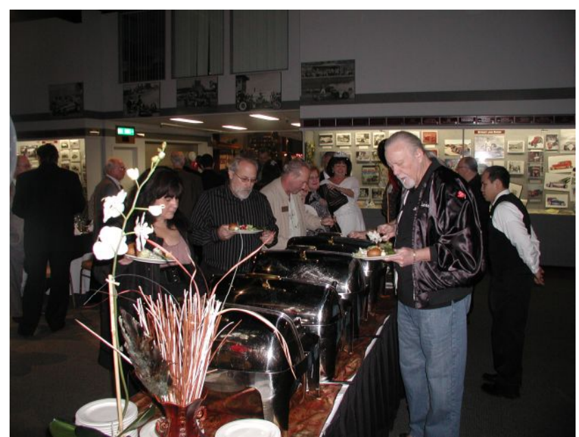
No One Went Hungry