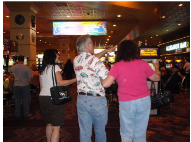
Checking out the facilities