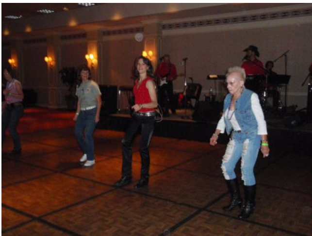
The Electric Slide