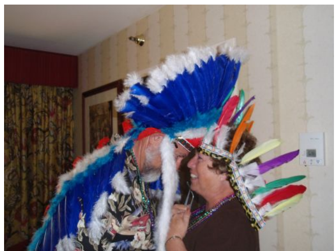
Joe's costume worked on anyone who wore it