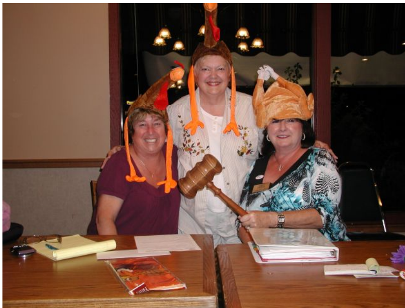
General Meeting Tuesday, November 2, 2010 Sizzler Restaurant – Fullerton, CA