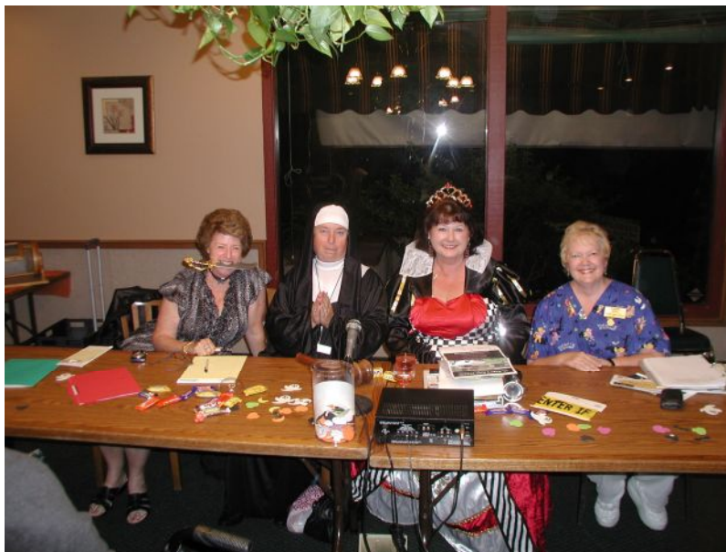
General Meeting Tuesday, October 5, 2010 Sizzler Restaurant – Fullerton, CA