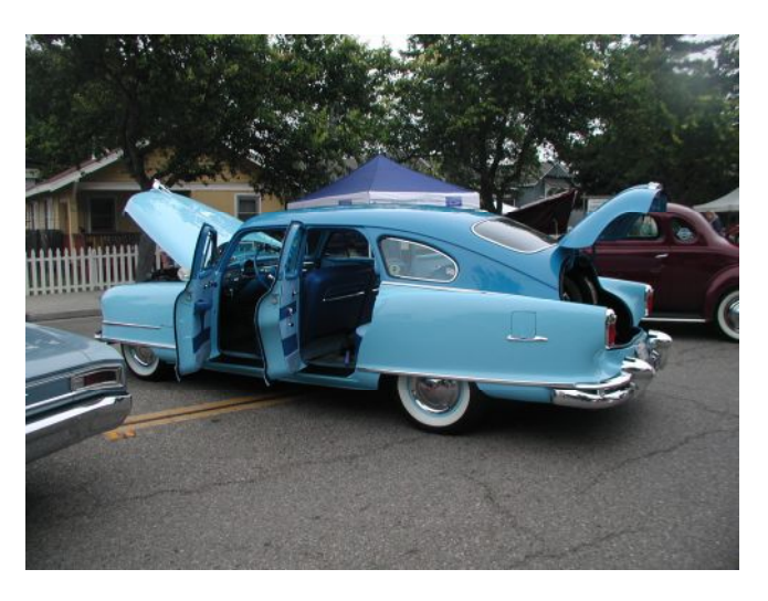
But there were some other great cars as well below.