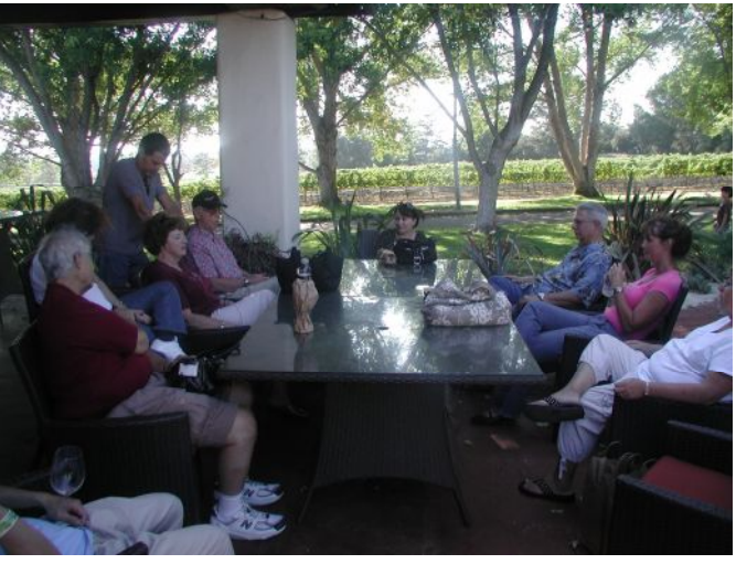
Who is this??