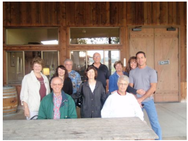
Then off to Fess Parker to taste and dress up some more!