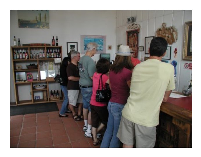
Mosby in the morning (is that a song??)