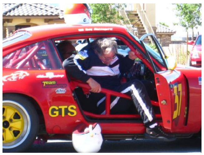
Looks like boney chicken to me