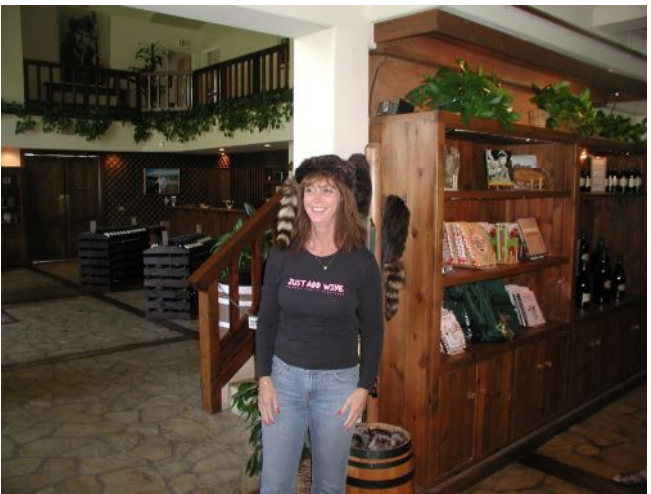
Now to keep on schedule we headed off for Firestone and a tour of the wine production.