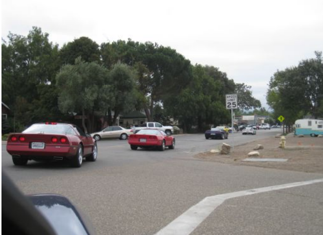
So finally we headed off for Los Olivos to get lunch before heading off to the last winery for the day at Bridlewood.