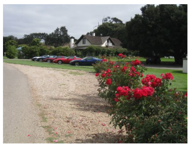
The first Winery was Rideau