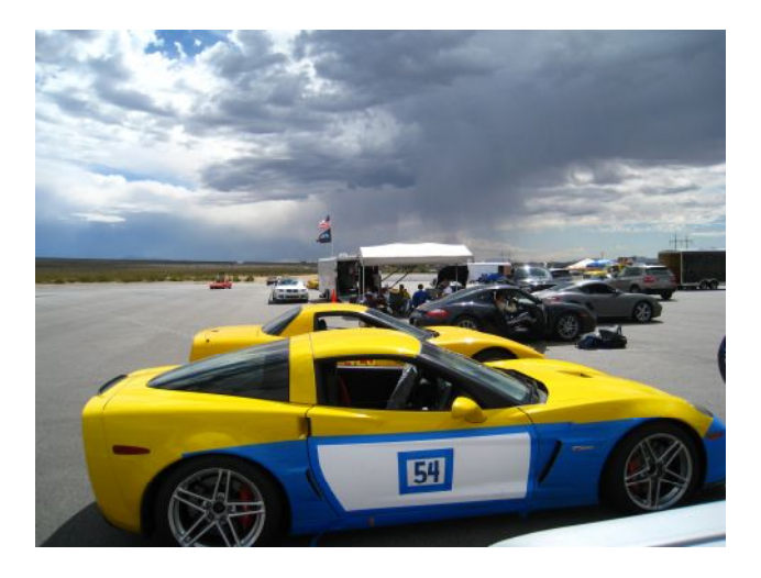
But your typical bystander scene. And yes it rained and according to Michele, rain and tape do not mix.