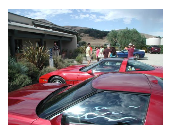
LaFond before lunch