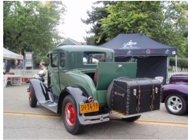
After the Car show we headed out to the first winery for the day at Zaca Mesa.