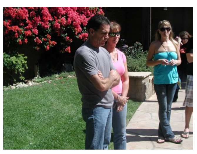
But it was getting to be lunch time and lots of wine and pallet cleanser crackers pretty much did some of us in.