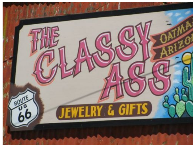
Not going to mention any names – lol