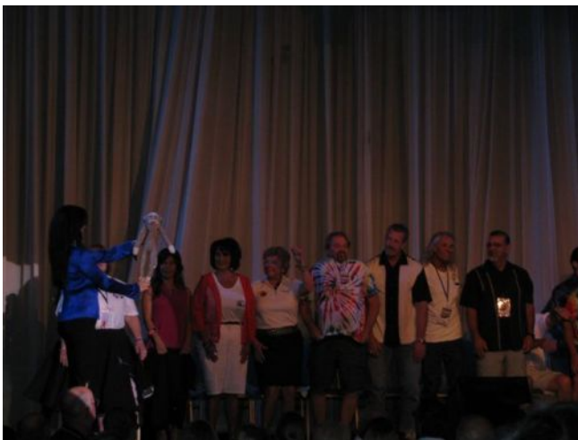
Who was the guy with the balloons??