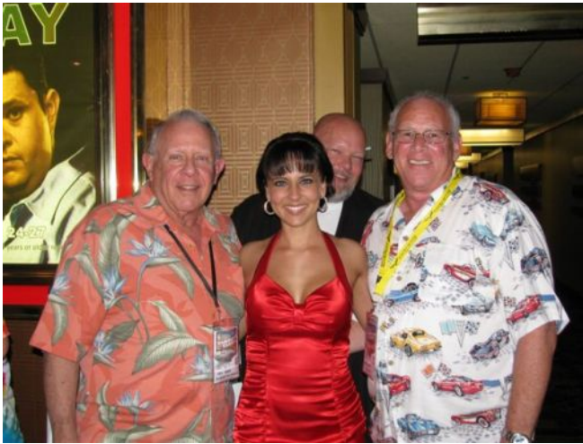
I want to know who the babe in the red is??