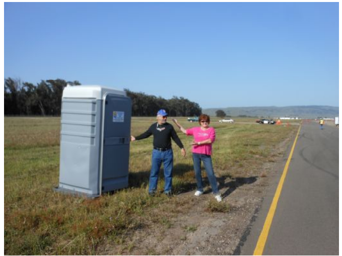
First things first. Yes that is the Police down there