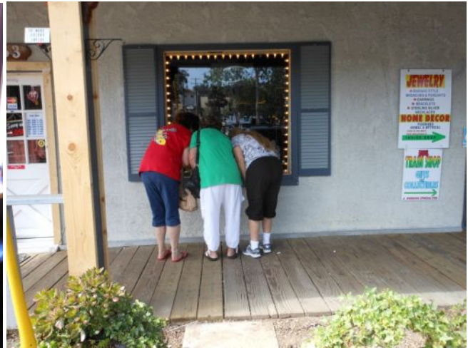
See Photo Ops galore!!