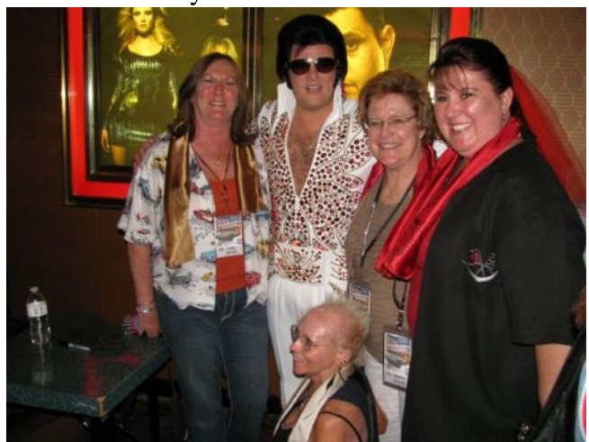
These smiles will never come off their faces!!