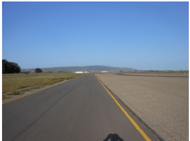
The track itself