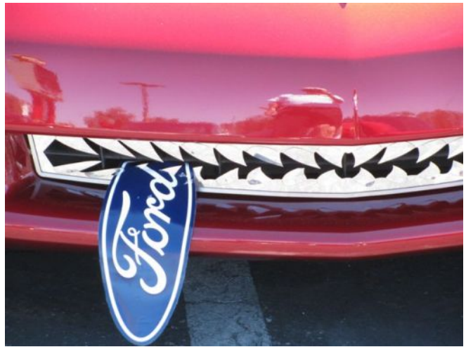
Maybe a Ford tastes like a chicken too!!