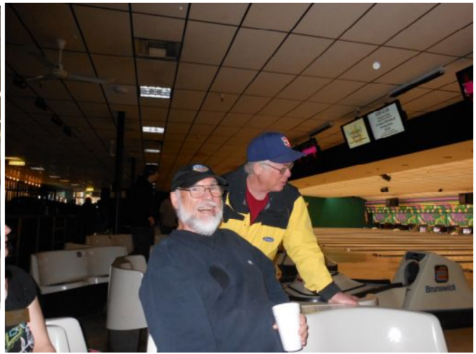
And yes I guess I do drool.