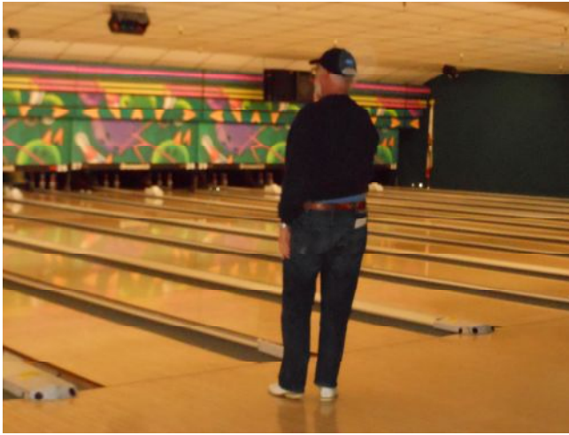
Take note of my shoes. Pat Boone Specials!