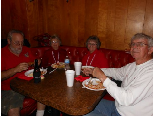
And then there was food.