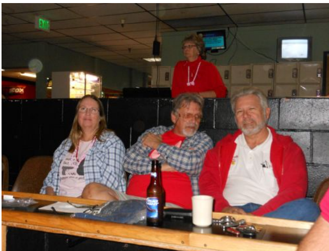
The Peanut Gallery