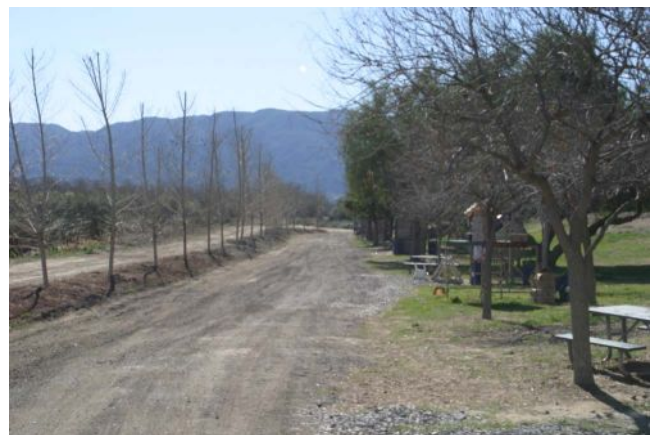
This is a typical stand. The shooter is inside and the targets are launched from behind them