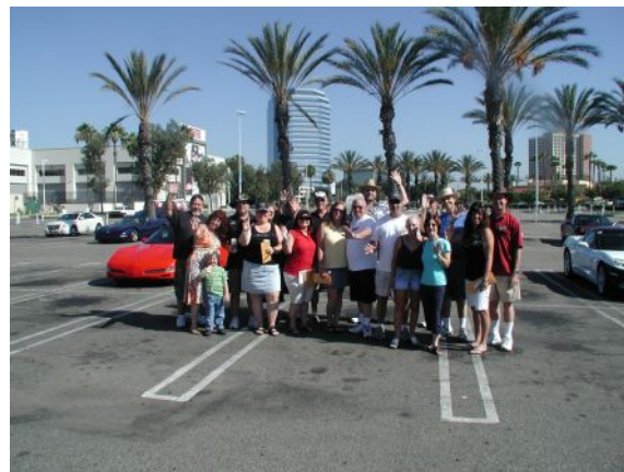
Mystery Run group 2009