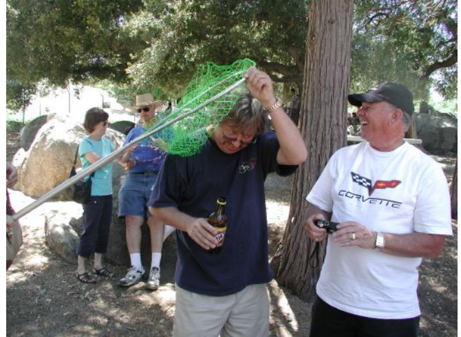
2009 was just a look at what was to come!