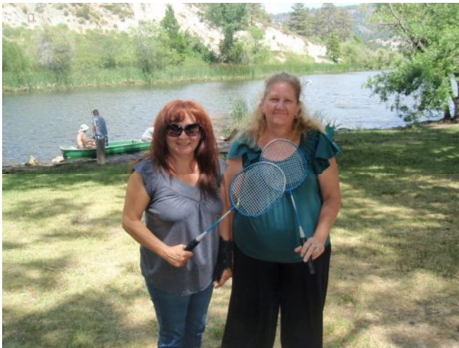
See the rackets look like my electronic alien catcher