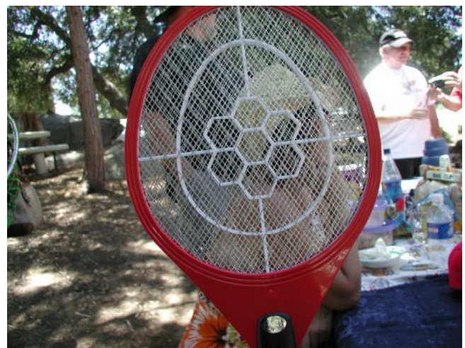
Geoff brought an electronic catcher with an LED that was supposed to reflect only off of aliens