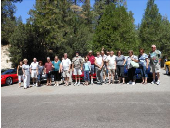
Mystery Run group 2012

The pictures below are in 2 columns. The left side are from the Jackson Lake mystery run and the right side are from the Alien Catching outing from 2009 to Mount Palomar just so that you can reminisce with me on the past and present and see what I mean about the ALIENS ARE BACK!