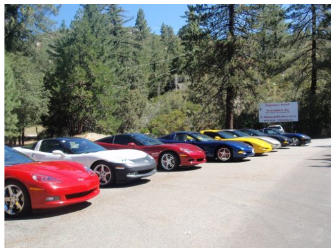
Breakfast stop at Newcomb’s Ranch.