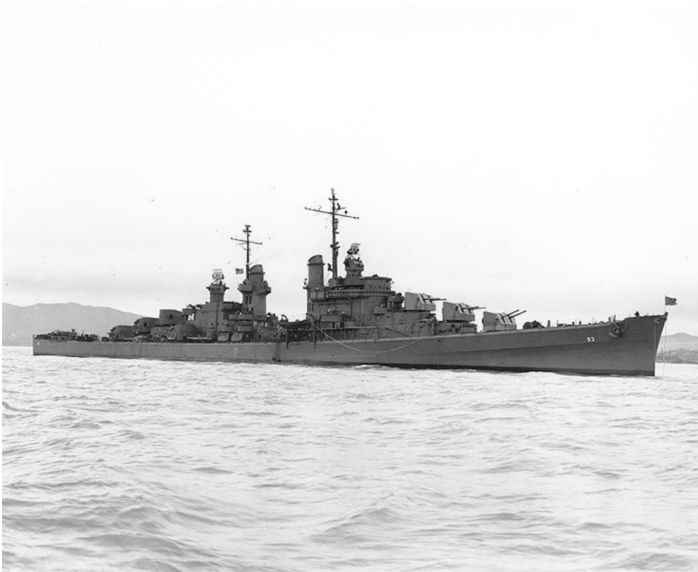
Photo # 19-N-60146 USS San Diego off San Francisco, California, 1 January 1944

The following is a picture of the USS San Diego number 2 in 1944