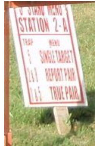
And Geoff .....and a sample menu