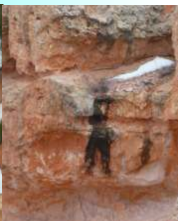
Look out for bears!