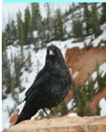
This bird followed us.