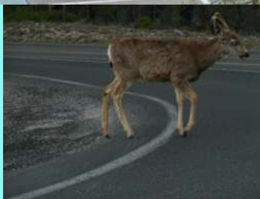
Beware of deer crossing!